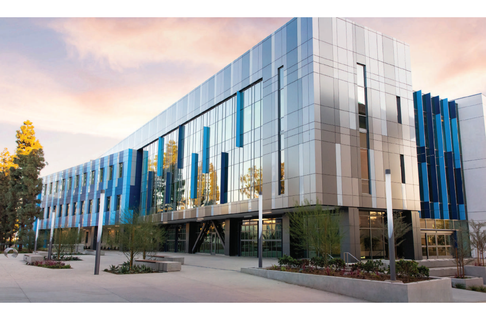
YORK® YVAA Air-Cooled Screw Chillers